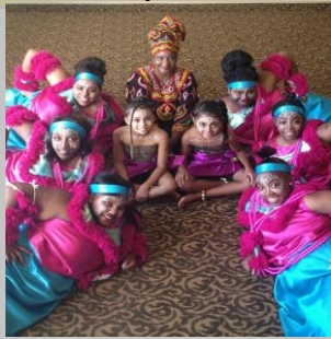
Performance by the African Masquerade Dancers