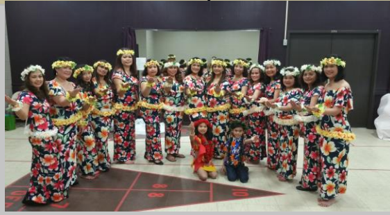
Performance by the Philippine American Greater Lansing Group/Sinulog Group

Luncheon will include: Exhibits, Employee Cultural Highlights a Delicious Catered Lunch By As You Like It Catering, Potter Park Zoo Catering, and Aldaco's Authentic Mexican Restaurant